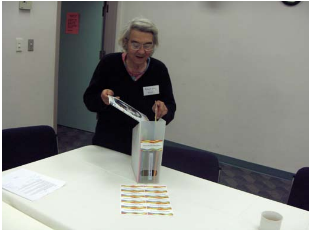
Mission Friends preparing reading boxes for local restaurants.

Mission Friends of the Library have been busy with various activities around the community. The Junior Friends of the Library teamed up with the Friends of the Library to take part in the Saturday Mission Farmers Market once a month. They set up a book sale table and had moderate success over the summer.