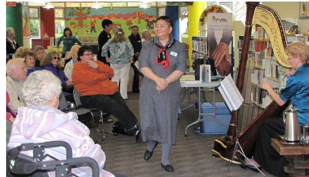
Friends of the Chilliwack Library celebrate their 20th Anniversary on November 4, 2009.