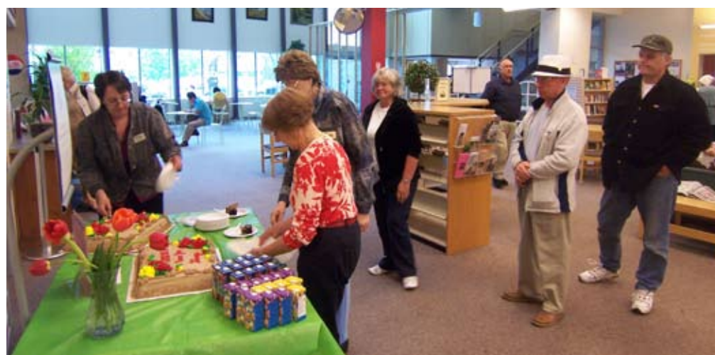
Friends show library users how much they are appreciated on Customer Appreciation days.

On a typical Customer Appreciation Day a steady stream of people of all ages cluster around the table,