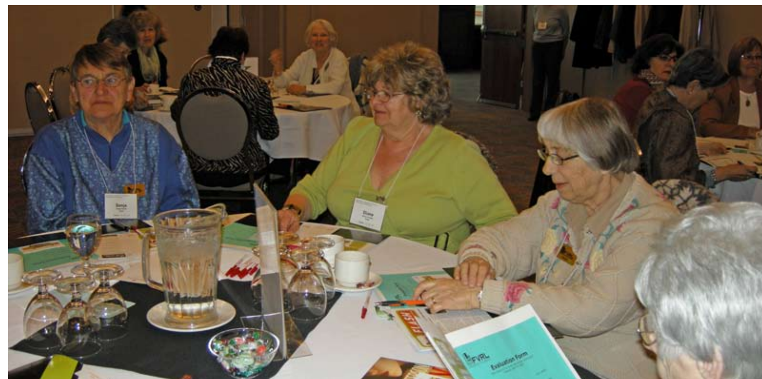
Friends of the Hope Library at the 2009 FOL Appreciation Luncheon on Saturday, April 25.

Friends from all over the Fraser Valley came together to share ideas at the 2009 FOL Appreciation Luncheon on Saturday 25 April 2009. To facilitate discussion, the following topics were suggested: advocacy, book sales, community, donations, events, fundraising, games & galas, helping hands, ideas, joining, acknowledgement and learning. Listed below are ideas different Friends' groups have tried or the result of brainstorming at the Appreciation Lunch. For the complete list, please contact your local FOL liaison. For your convenience, we have grouped closely related topics together.