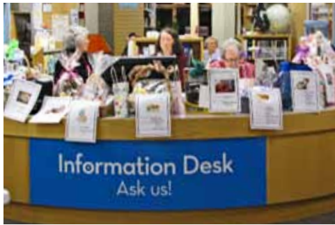
Quiz Night prize baskets on display