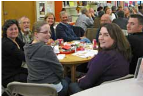
Quiz Night team: A Family Affair