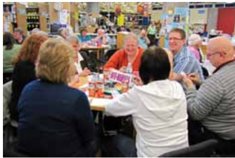
The InfoManiacs are set to get started

the quiz questions asked throughout the evening. This has become a popular social event in Chilliwack!